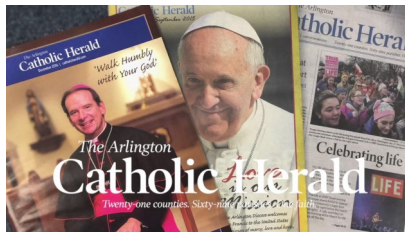
Arlington Catholic Herald